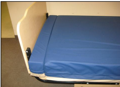
Gap Filler - 36"x4"x6" ht