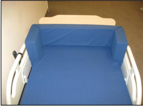
Bed Bumper Horseshoe Pad