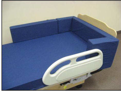
Rail Bumper Pad 28", 56" and 84"