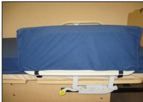
Padded Side Rail Cover Quarter - 28", Half - 48", Full - 68"