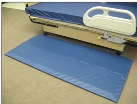
Floor Fall Mat 32"x70" Foldable with Tapered Edges