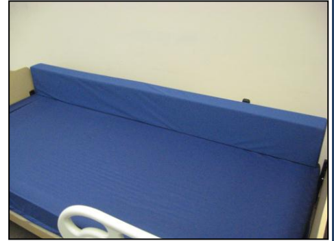
Rail Bumper Pad - 84"